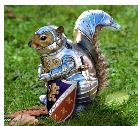
Hawk-proof Squirrel suit.