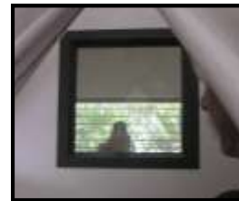
Kachina peeks out of her door's window in anticipation of her "field trip"