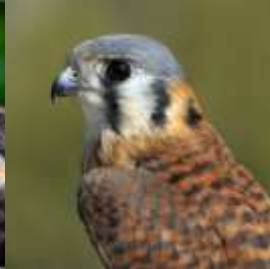
American Kestrel Kachina