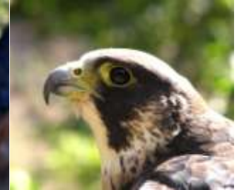
Peregrine Falcon Kisa