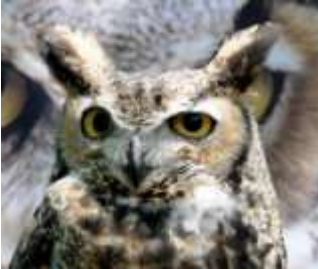
Great Horned Owl Max