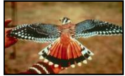
Back view of wild male American Kestrel

“ MAK ” (his temporary name) was just adopted from “Desert Wildlife Services” in Tucson, AZ. This year’s hatchling, MAK has spent most of his short life in rehab. Just out of the nest and learning to fly, he collided with a car, and fractured his right wing at the shoulder. He spent a full 9 months in rehab (3 months of healing, and 6 more months waiting for his transfer permit). Although it is tragic that he cannot live out his life in the wild, it is the best possible scenario for adjusting to a life as an educational bird. The longer a bird has lived in the wild, the longer it takes for it to adapt to living with humans.