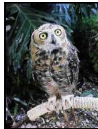
Max at six months old.