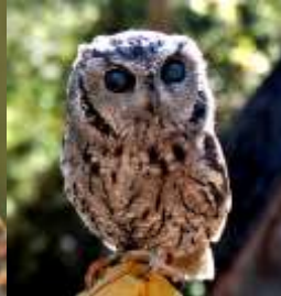
Western Screech Owl Puku