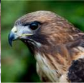
Red-tailed Hawk Ivan