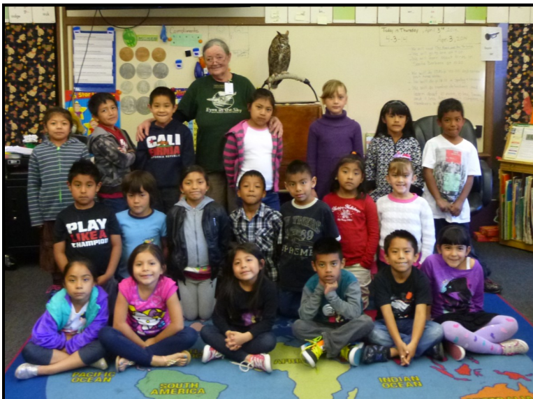
To view the field trip photos in full resolution please visit