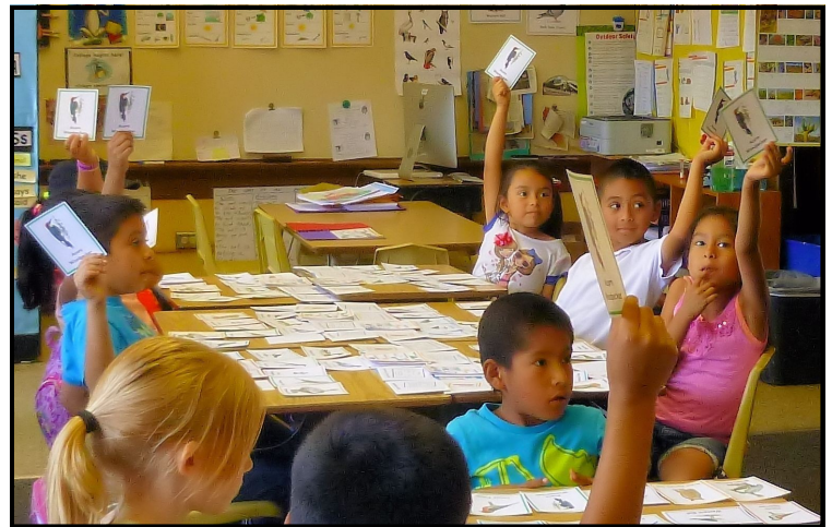
Classroom games: matching bird cards to bird sounds, clue cards to bird pictures, and feet or beaks to birds.

As always, teachers and students responded with great enthusiasm, and it's become infectious. Teachers report that the whole campus is now bird watching, with young students educating the older ones about the birds on campus.