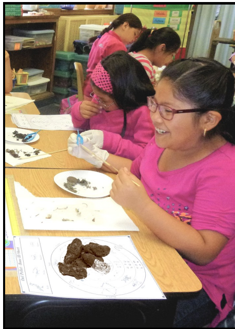
For some reason, the "yuck" factor makes owl pellet dissection especially appealing to young students.