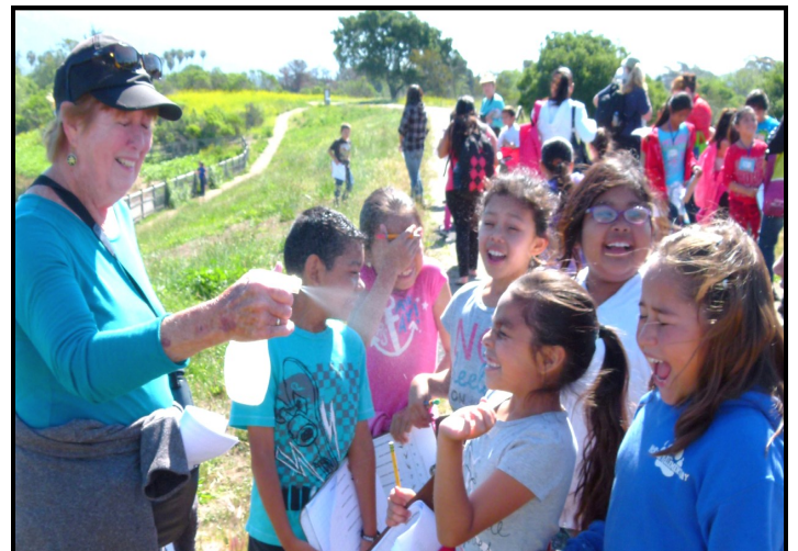
Our field trip walk around Lake Los Carneros is always a big hit with the students.